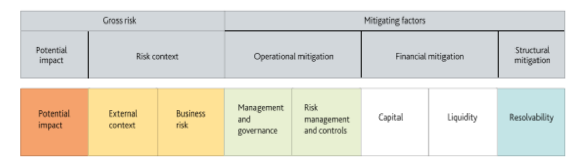
FIGURE 1:THE UK, PRA APPROACH

The implementation of any supervisory approach typically involves a number of steps. Figure 1 provides an outline of how the UK's Prudential Regulation Authority (PRA) approaches the task of assessing bank risk. (Somewhat similar approaches are followed by the Canadian OSFI and the Singapore MAS and APRA).