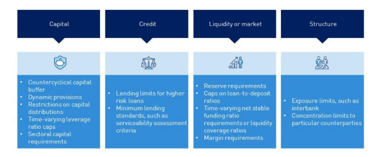
FIGURE 3: APRA'S MACRO PRUDENTIAL TOOLKIT

Fundamental to the framework is that ADIs must have systems in place which will enable them to implement changes such as limiting high-risk lending growth if required by APRA. "Across the ditch" (ie in New Zealand) the RBNZ is <u>considering</u> maximum loan-to-valuation and debt-to-income restrictions as well as interest rate floors because of concerns about unsustainable house prices creating a threat to financial stability.